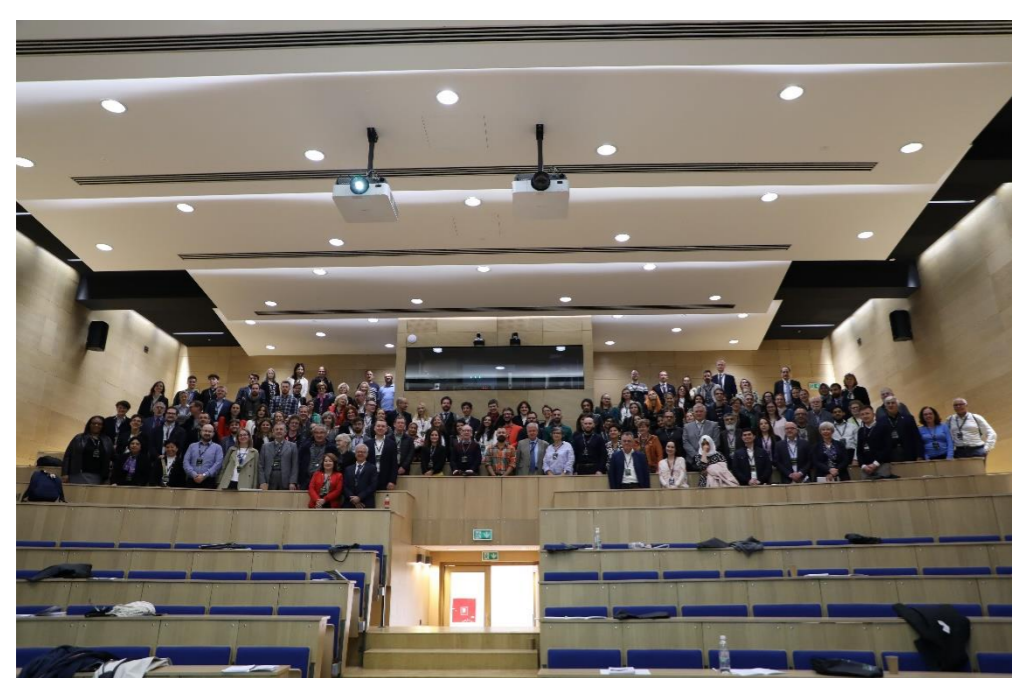
The group photo of participations of the 5th IRPC.

The University of Zagreb School of Medicine, Croatia, hosted the 5th International Renal Pathology Conference in May 2023. The conference was organized by the Renal Pathology Society (RPS) in collaboration with the European Society of Pathology's Nephropathology Working Group, the University of Zagreb School of Medicine, and the Nephropathology Working Group of the Croatian Society for Pathology and Forensic Medicine. It was held in a hybrid format, with both in-person and virtual participation via Zoom, and was attended by 370 participants from 62 countries worldwide. The program featured 27 invited speakers, all renowned international experts in kidney disease, covering areas such as renal pathology, pediatric and adult nephrology, rheumatology, and clinical genetics. Each day included a Clinicopathologic Conference, during which 17 interesting case reports were presented and discussed. There were also 61 poster presentations, with awards for the top three posters, as well as 19 bursaries for participants from low- and middle-income countries. We are honored that the conference went smoothly and exceeded expectations. Participants expressed great satisfaction with the program, organization, and hospitality, which is a source of pride for us.