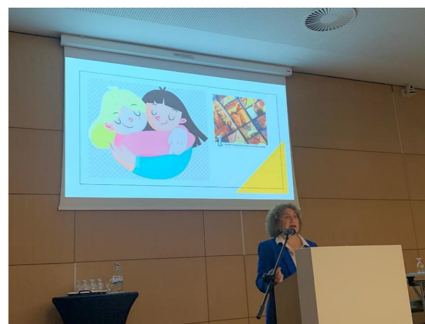
1st PACIT Joining efforts