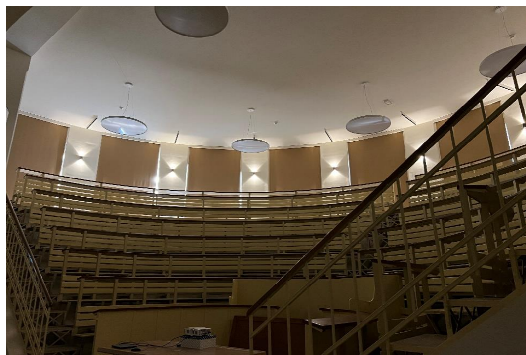
Amphitheatre in renovated building of the Institute of Pathology.

On July 12, 2024, after 16 months of intensive work and two weeks ahead of the contracted deadline, the reconstruction of the Institute of Pathology University of Zagreb School of Medicine was completed. During the renovation, all laboratories (Histology, EM, and Molecular with tissue culture), administration, teaching staff, and teaching facilities were temporarily relocated to either the campus or nearby locations. Remarkably, the staff quickly adapted to the improvised setup and even managed to expand their activities, achieving better results than before the disruption. The Institute of Pathology, dating back to 1922, covers around 6,000 m 2 and includes a lecture hall (amphitheatre), two seminar rooms, a library, a macroscopy museum, and several laboratories, with its molecular pathology lab being the largest of its kind in Croatia.